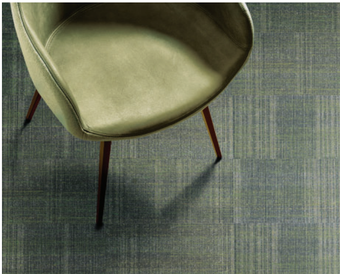
Forbo Flotex Prairies

Sustainability Report: Click Here: Forbo Annual Sustainability Report